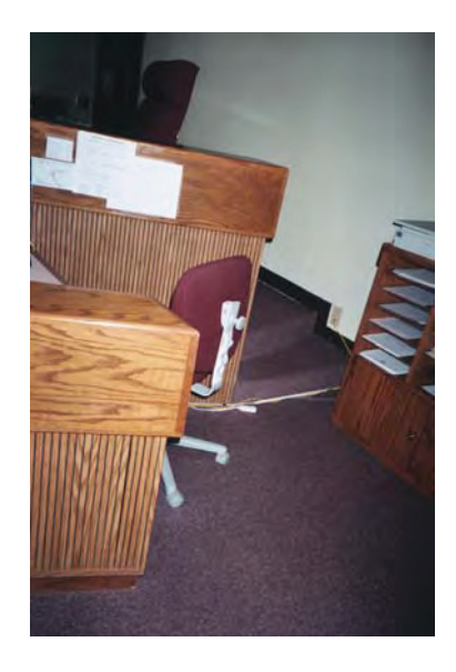
C. Courtroom C is used primarily for juvenile proceedings; consequently there is not need for a jury box. There are tables for lawyers and parties, and some limited access seating. There is a small step up to enter the witness chair, although this could be removed or the witness could sit in front of the witness stand if necessary.