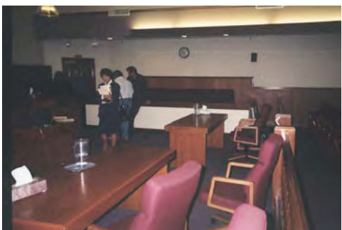
B. Courtroom B had the same issues with respect to the step up for the witness box. There was not step up for the jury box, but a juror using a wheelchair would have to sit outside the actual box unless seats are removed. The space for attorneys was adequate, and spectators could sit at the end of rows.